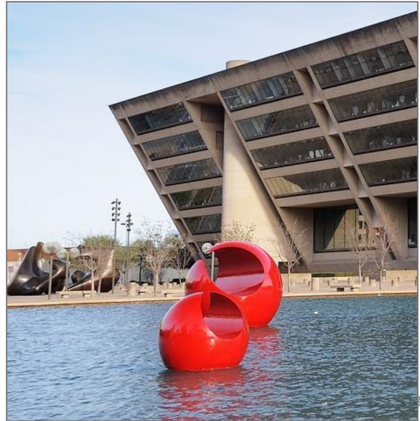
Marta Pan, Floating Sculpture (1979), Dallas City Hall