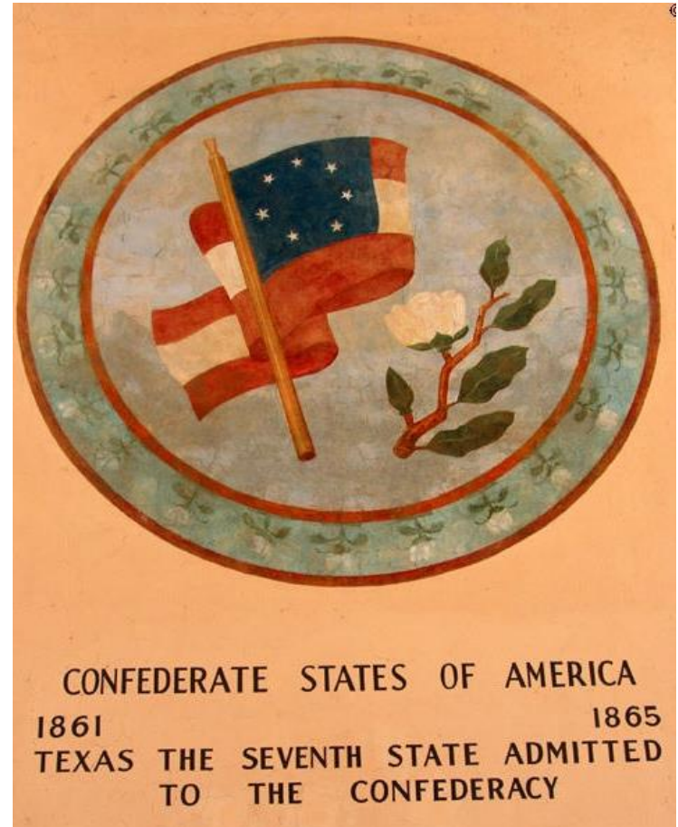
Confederate Roundel , 1936