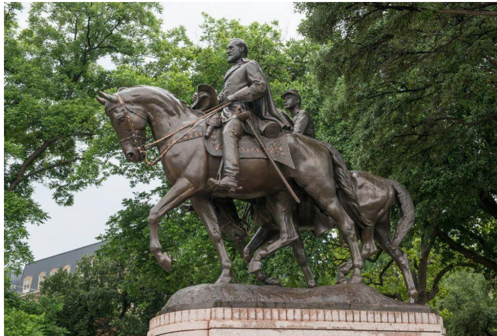
Alexander Phimister Proctor, Robert E. Lee and the Confederate Soldier , 1936