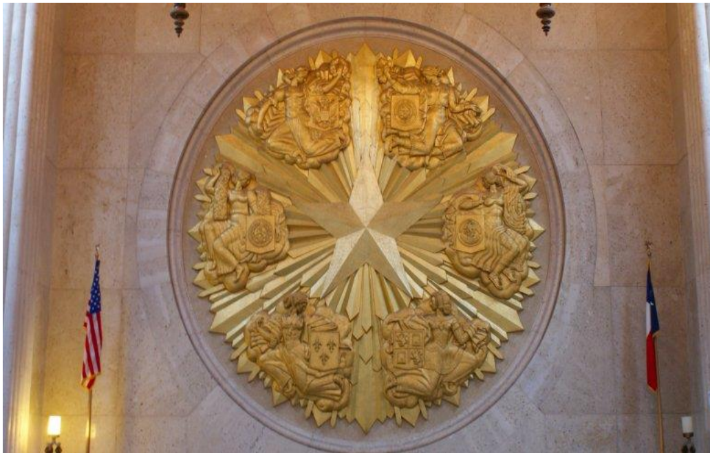
Joseph Renie, The Great Seal of Texas , 1936