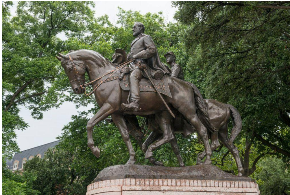
Alexander Phimister Proctor, Robert E. Lee and the Confederate Soldier , 1936