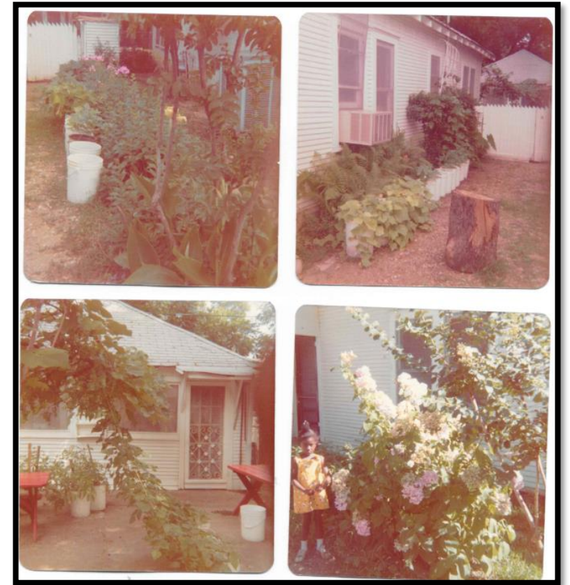
Craft House, 1974 garden and plantings