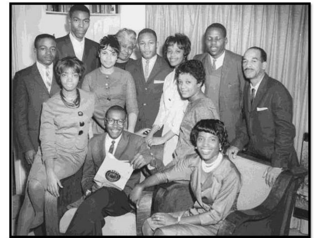
NAACP South Dallas Youth Council, Craft House living room early 1960's