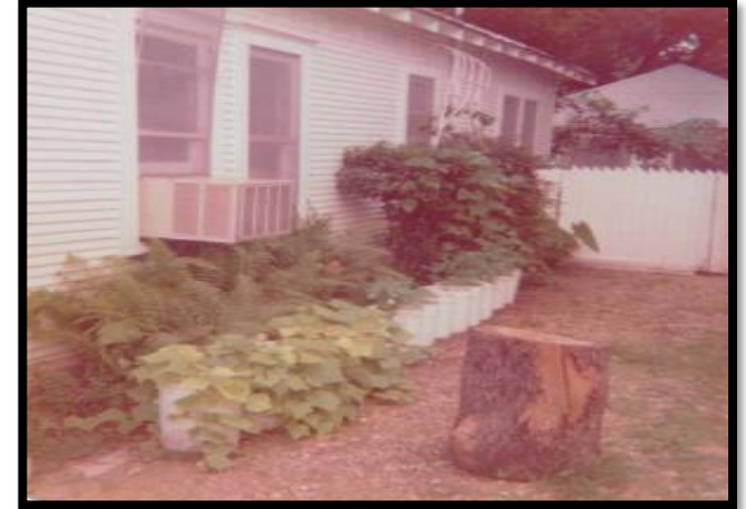
Craft House, 1974 prior to driveway installation