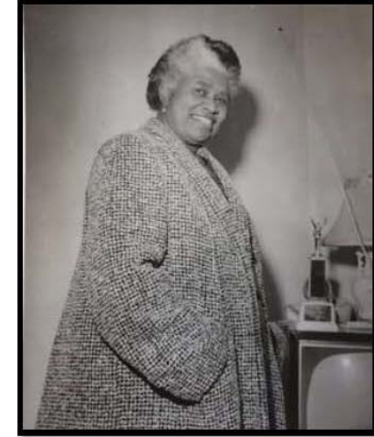
October 17, 1955 the morning of State Fair protest