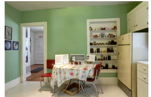
Craft House, June 2018 Kitchen