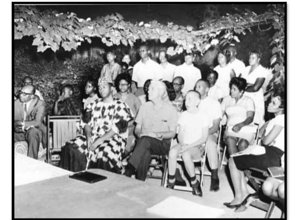
United Nations Association meeting, guests from Africa Craft Backyard ca.1965