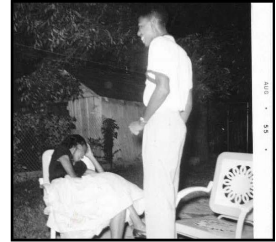
NAACP Youth Council backyard of Craft home , ca.1955