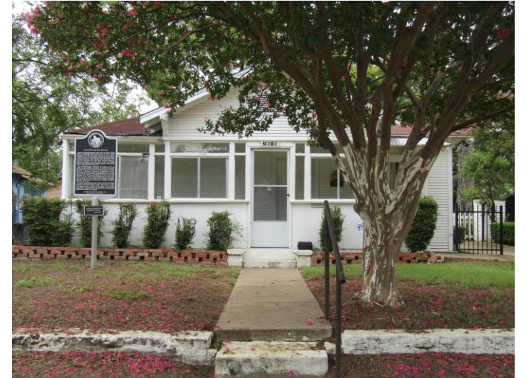
Juanita J. Craft Civil Rights House & Memorial Garden December 2018

The goals established by the HSR are to address the preservation of the house for the purpose of inspiring and transforming lives through service.