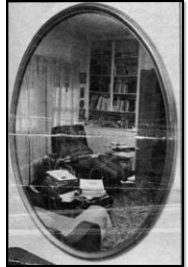
Craft House November 21, 1976 reversed photo taken from front door