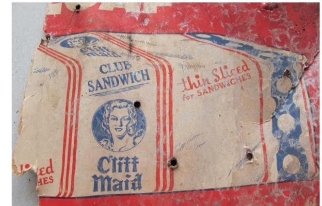
Poster remnant @ wall board uncovered with remediation, June 2018