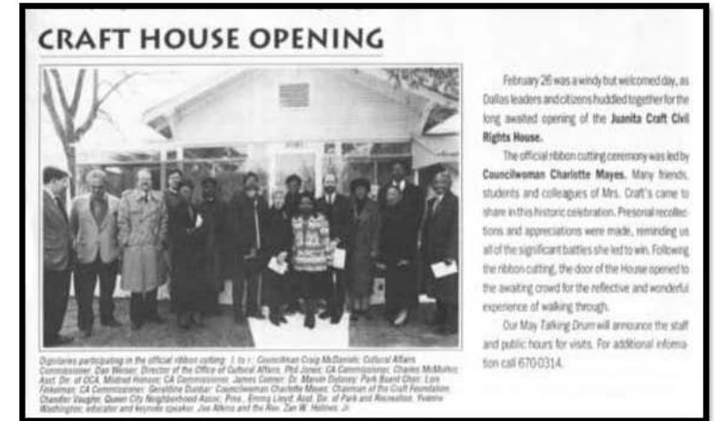
Talking Drum newsletter, South Dallas Cultural Center February 26, 1994

It has been operated through the South Dallas Cultural Center by appointment since 1994 until it was closed in May 2018 as the result of a burst pipe.