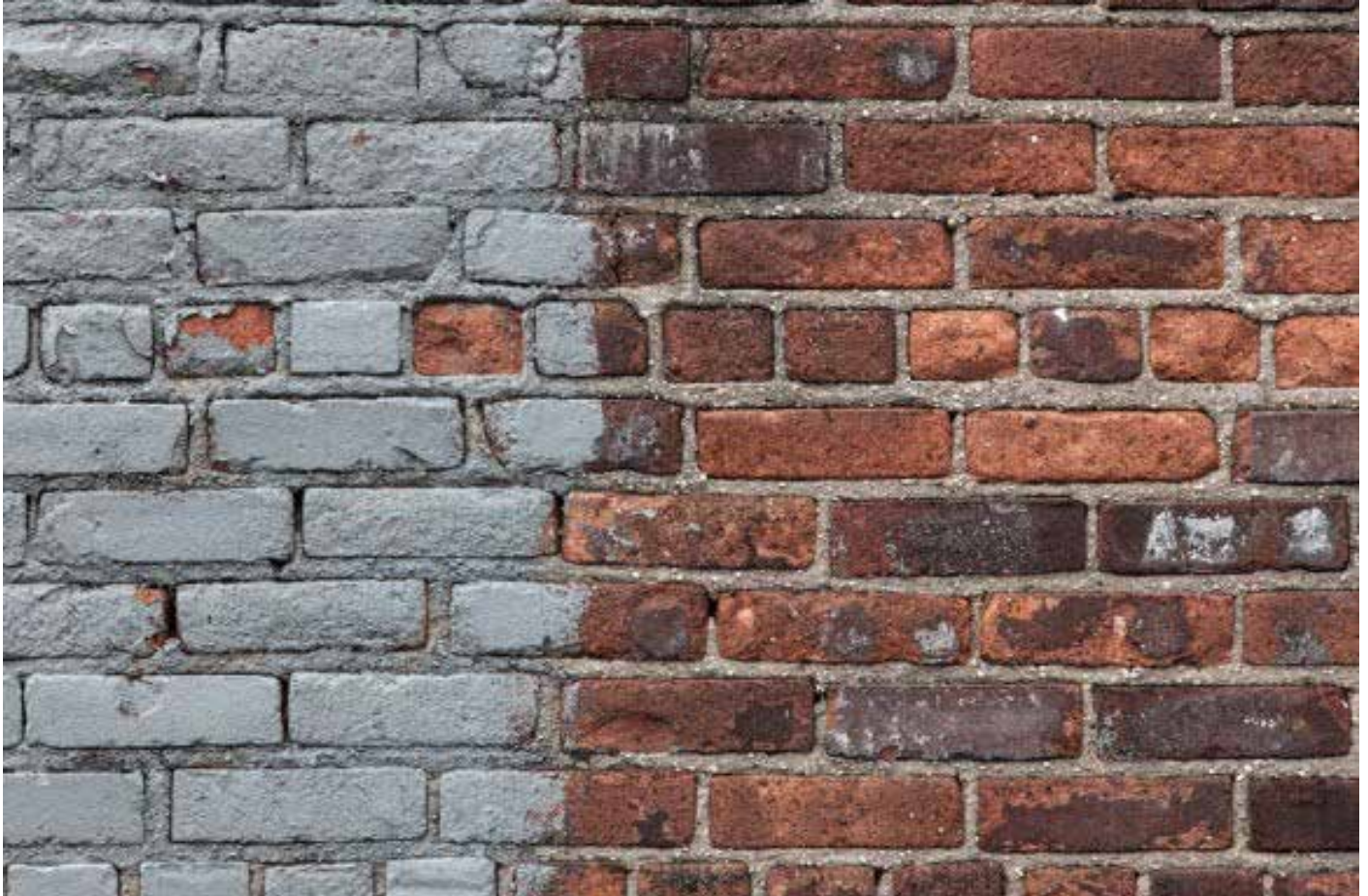
Primed/ unprimed brick wall