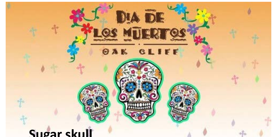
Sugar skull classes at OC3