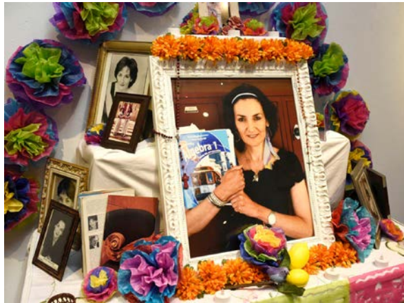
Day of the Dead altars at OC3 and LCC