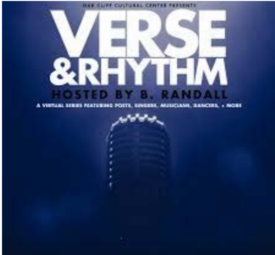
Verse and Rhythm at OC3