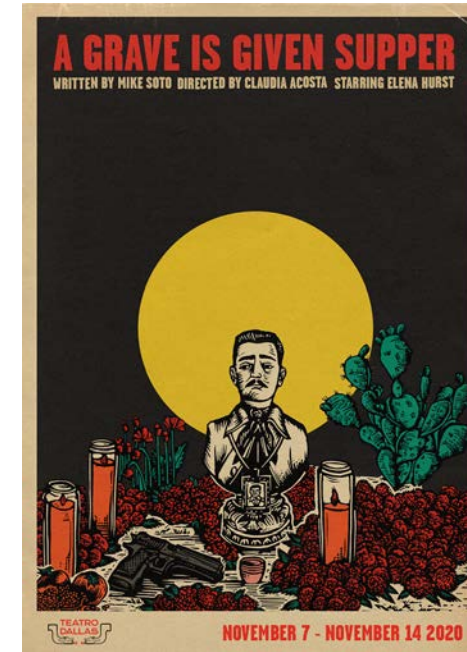
Cara Mia Theatre and Teatro Dallas at LCC